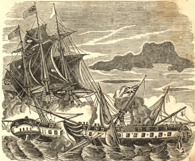
BATTLE OF THE CONSTITUTION AND GUERRIERE.....COMMODORE HULL.